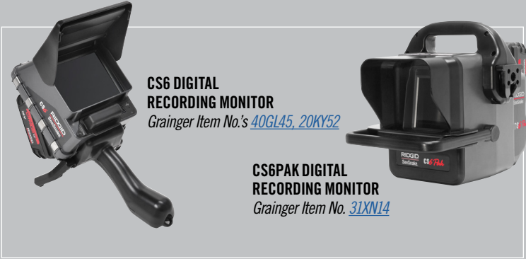
CS6 DIGITAL RECORDING MONITOR Grainger Item No.'s 40GL45 , 20KY52