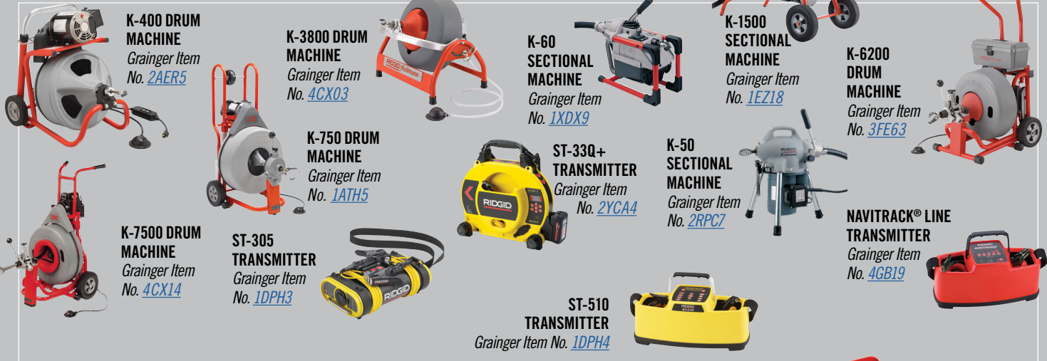
K-400 DRUM MACHINE Grainger Item No. 2AER5