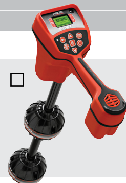
NAVITRACK® SCOUT® LOCATOR RIDGID Cat. #19238