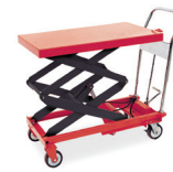
Scissor Lift Tables