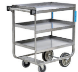
Stainless Steel Transport Carts