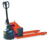
Semi-Electric Pallet Trucks