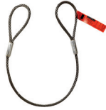
Wire Rope/ Mesh Slings