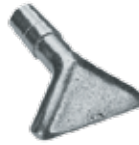
6X886 7 in. Metal Gulper Tool (use with hose only)