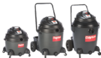
3VE21 1UG91 2RPD8