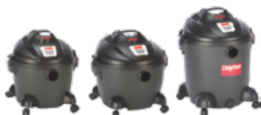
3VE18 3VE19 3VE20