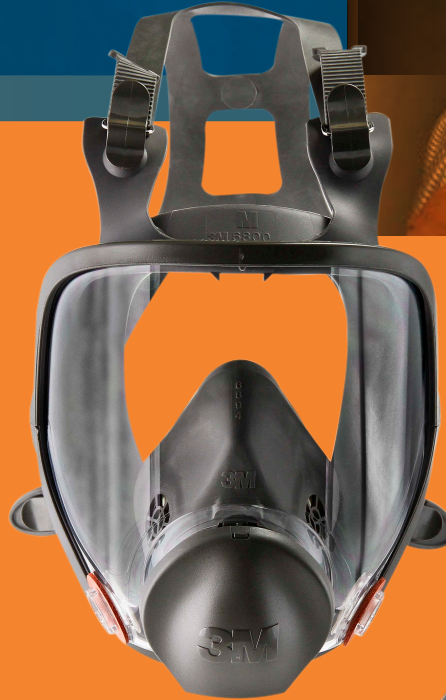
6000 Full Facepiece

with the purchase of 3M Reusable Respirators