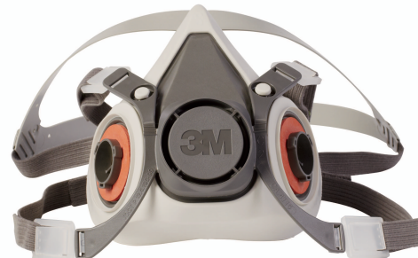
6000 Half Facepiece