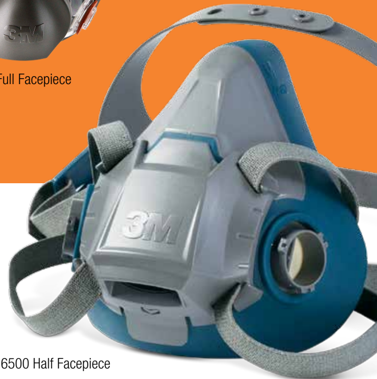
6500 Half Facepiece

Receive 100 free filters (50 pairs) of premium 3M™ Advanced Particulate Filters 2297 (Grainger Part #5WYZ6) with minimum purchase of assorted 3M™ Half or Full Facepiece Respirators. See reverse for offer details.